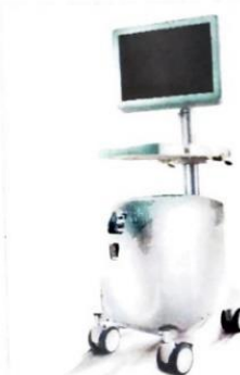
VABB technology has been instrumental in the field of breast health